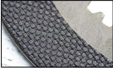
Close up view