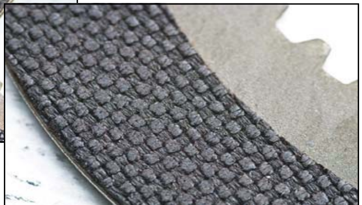
Close up view